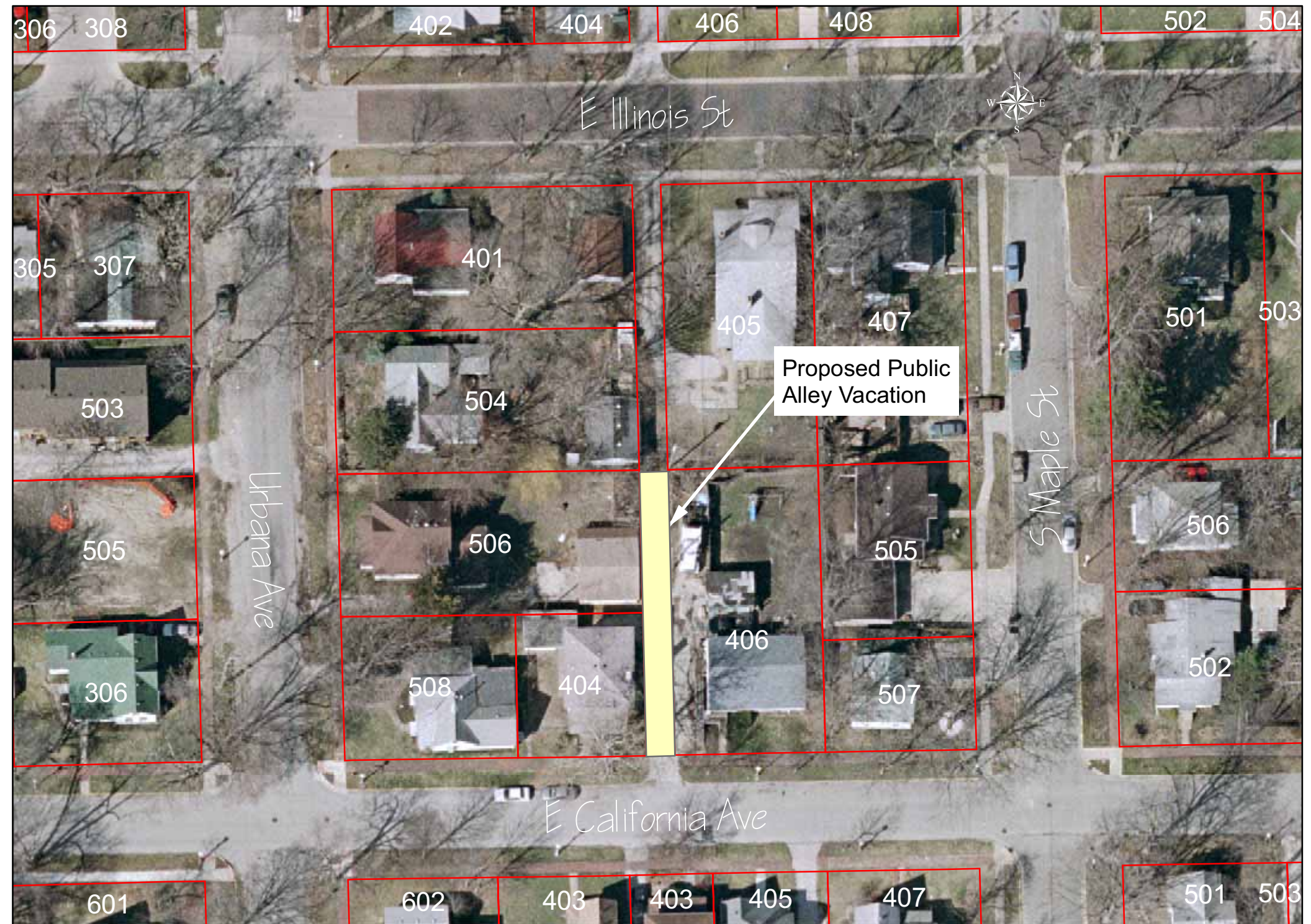
Proposed Alley Vacation