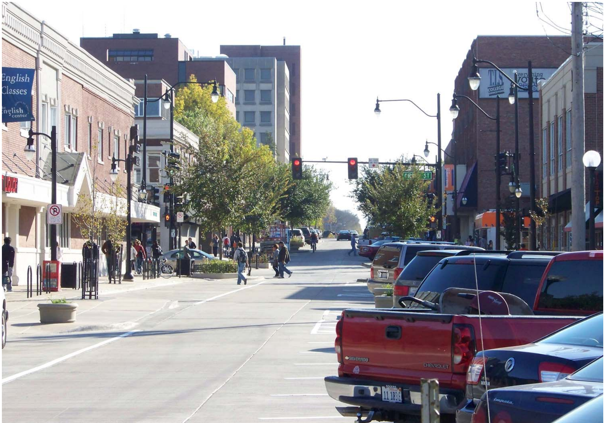
Existing – Sixth Street Lights