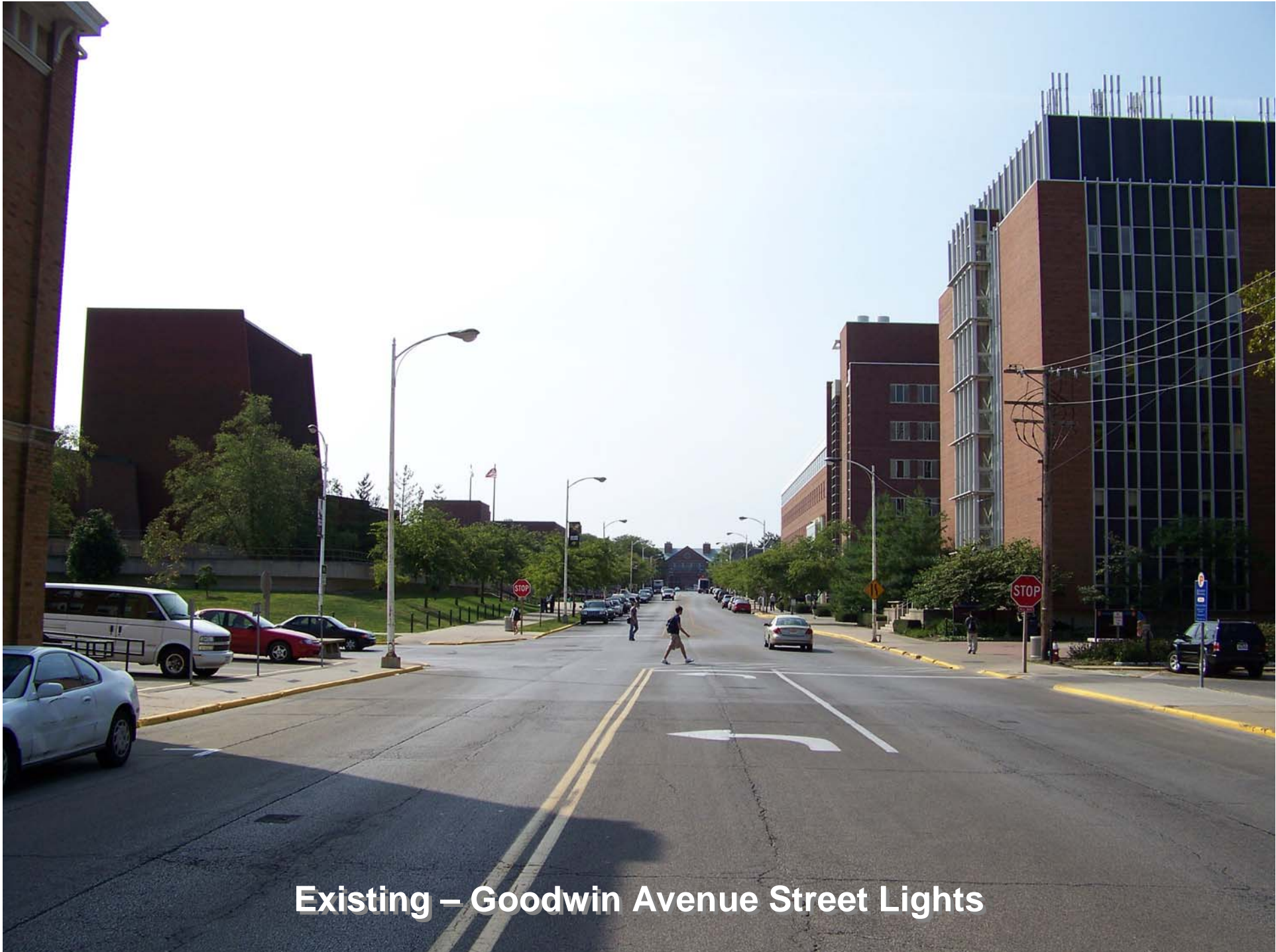
Existing – Goodwin Avenue Street Lights