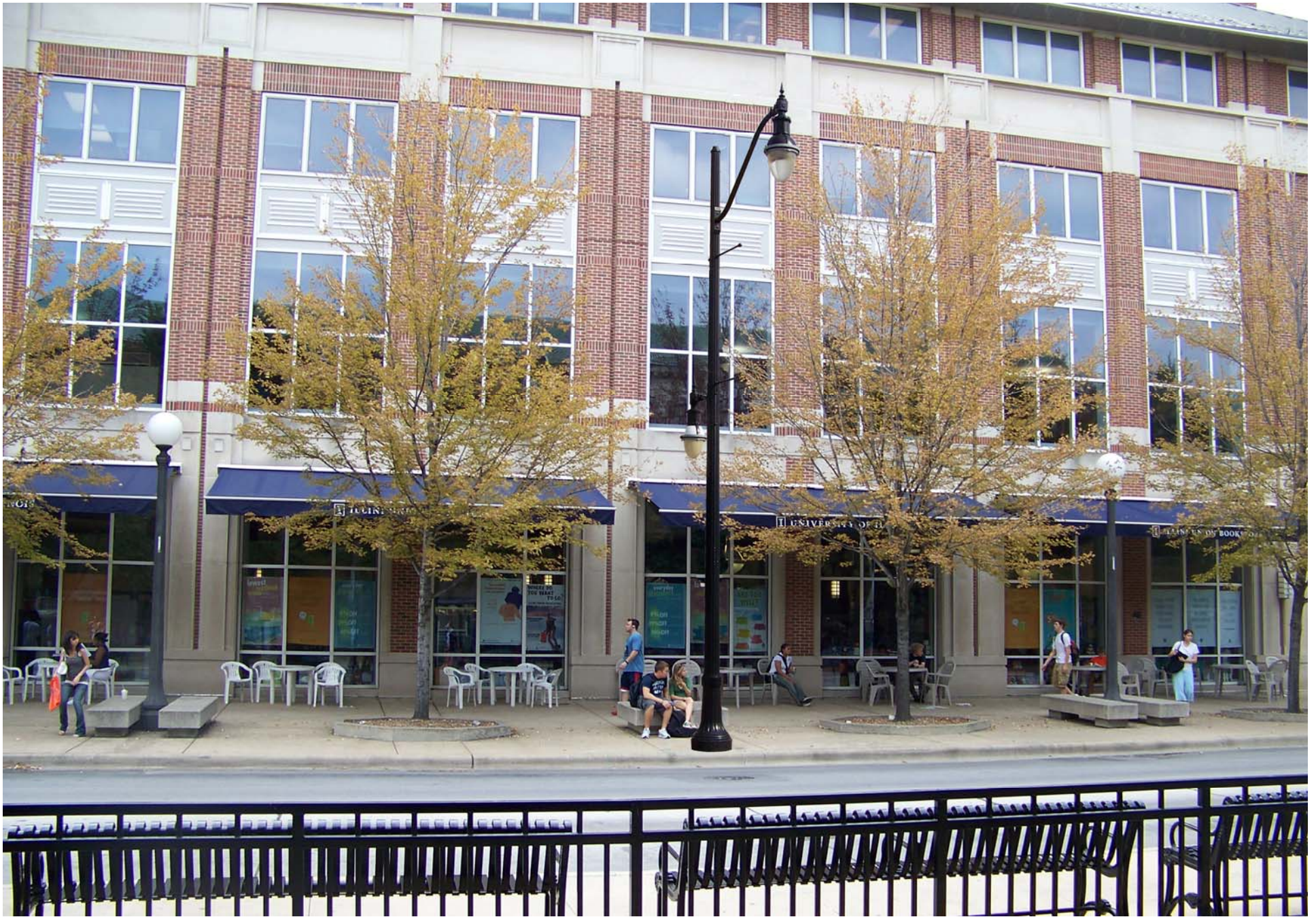
Proposed– Wright Street Lights with Existing Path Lights