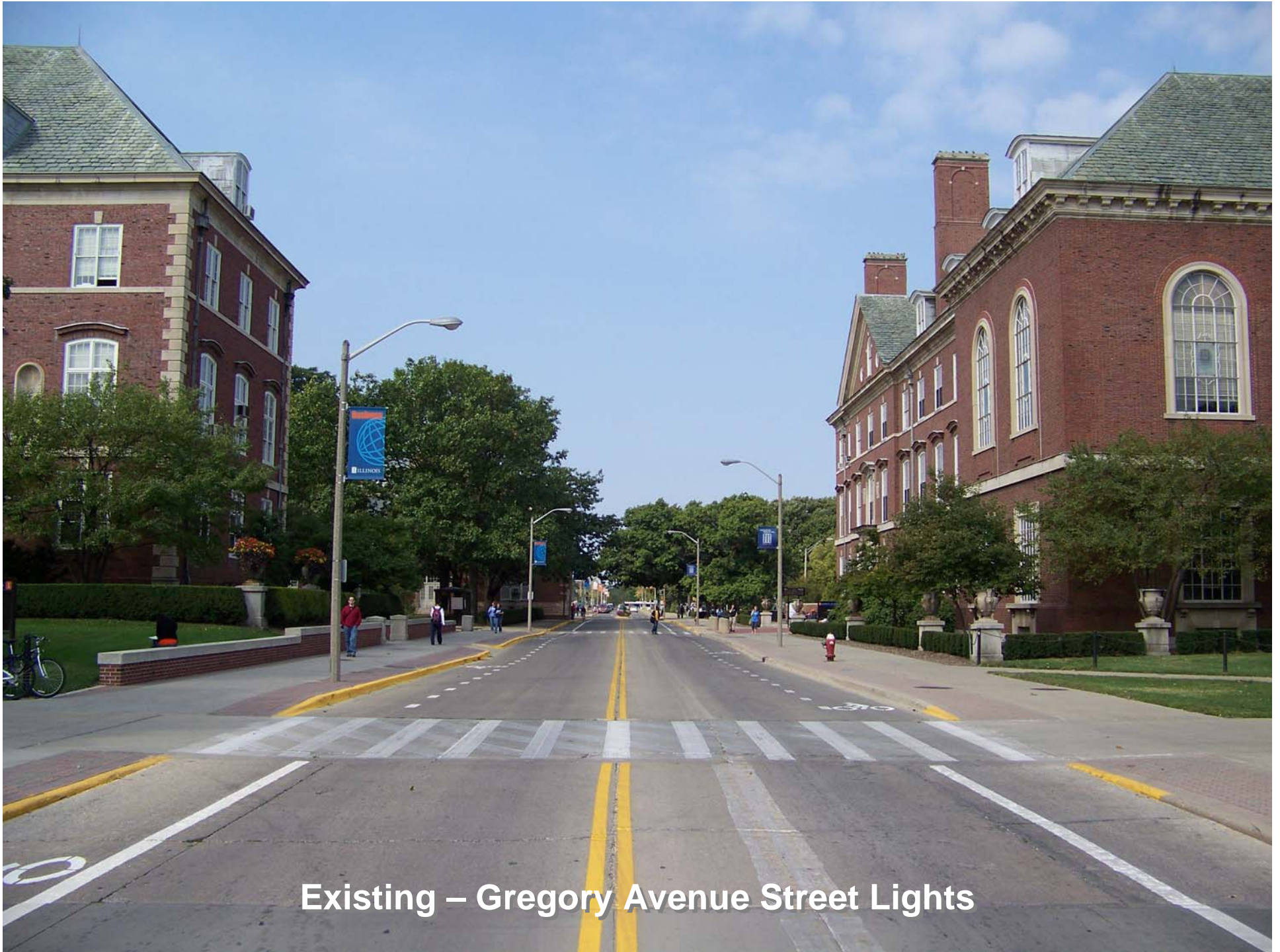
Existing – Gregory Avenue Street Lights