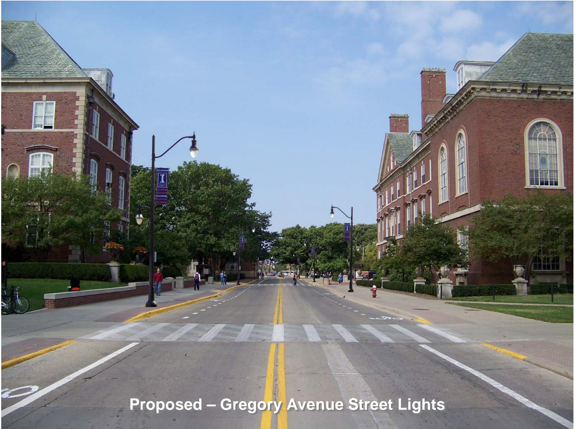
Proposed – Gregory Avenue Street Lights