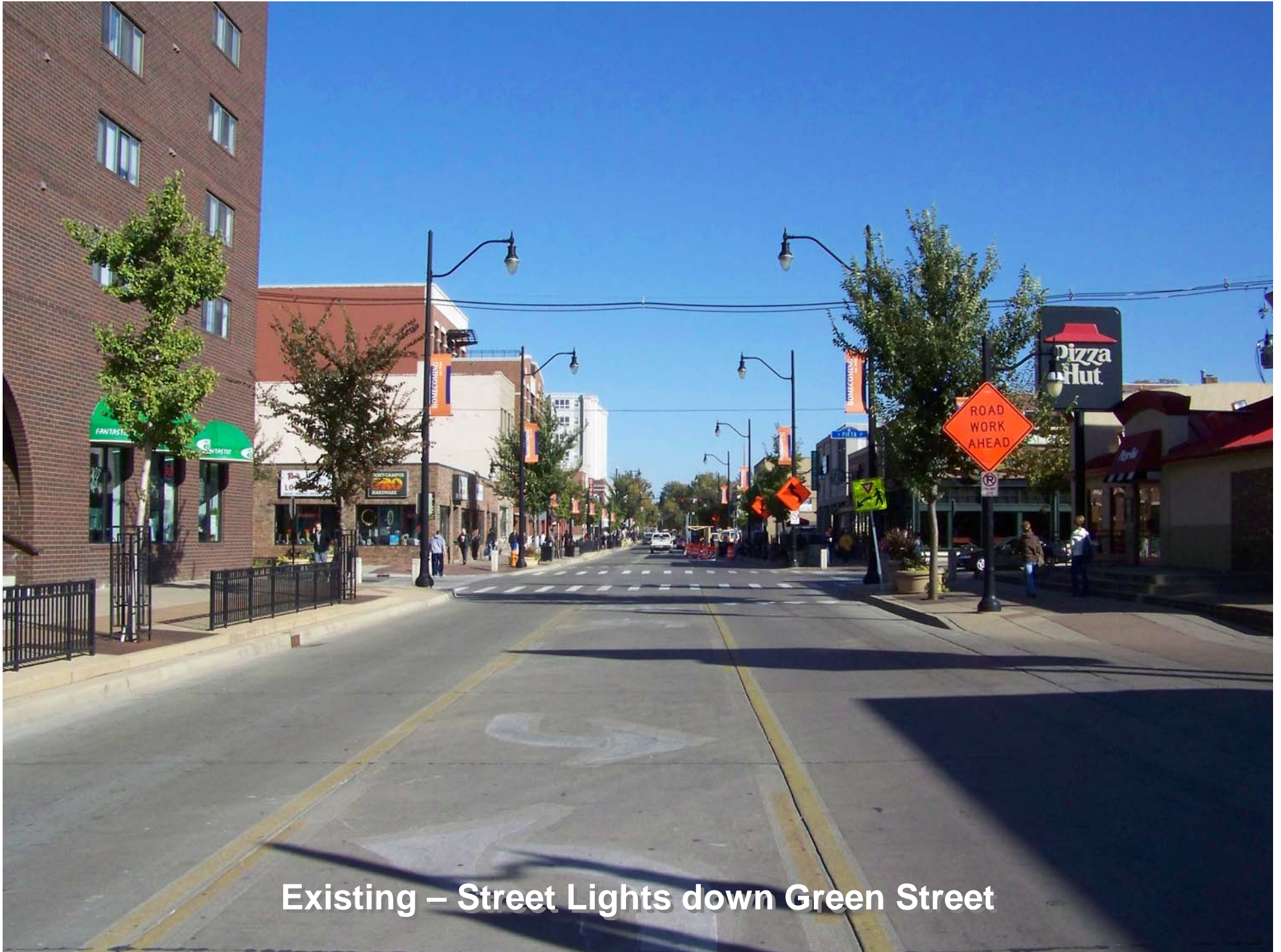
Existing – Street Lights down Green Street