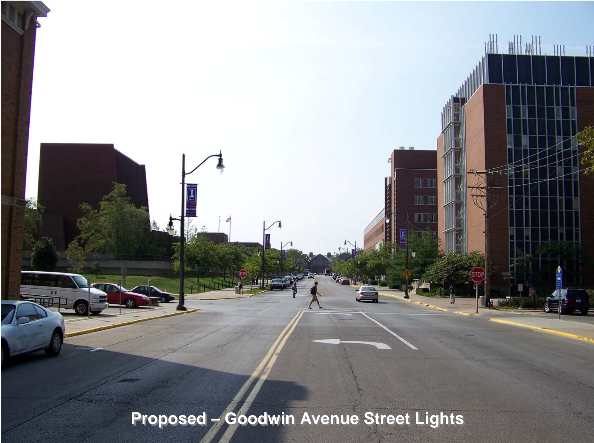
Proposed – Goodwin Avenue Street Lights