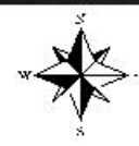
Exhibit "A" License Agreement 123 West Main Street