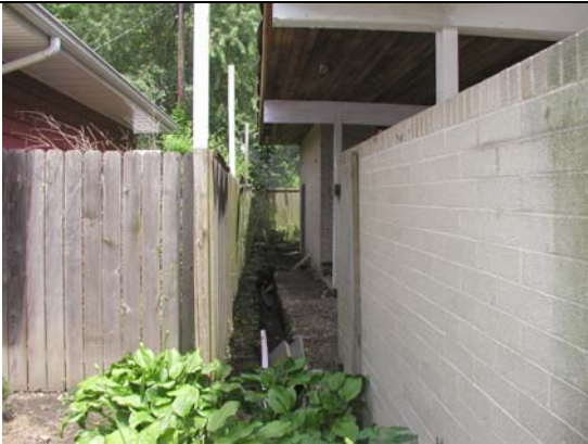
Down property line – wall goes just inside roof eaves