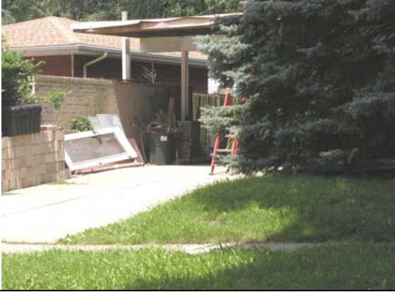
Facing north west to car port and retaining wall