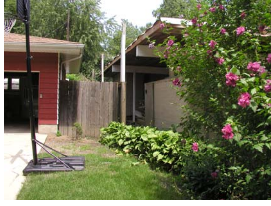
From Neighbors Driveway