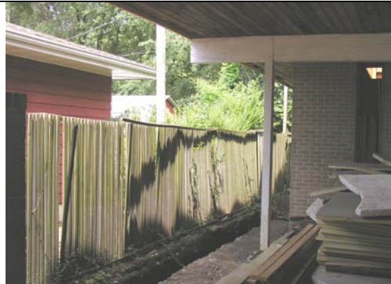
Into carport at fence and neighbor garage