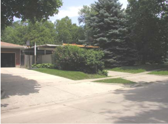
Facing north east – traffic view – neighbors garage left