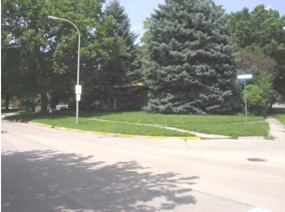
Facing north west – traffic view –Vine St. at right