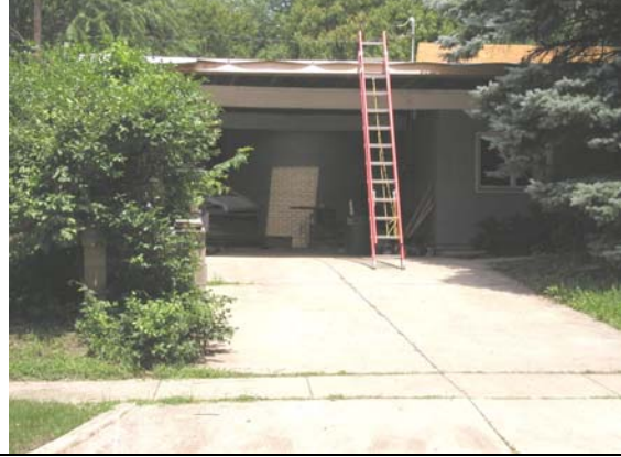
North toward carport