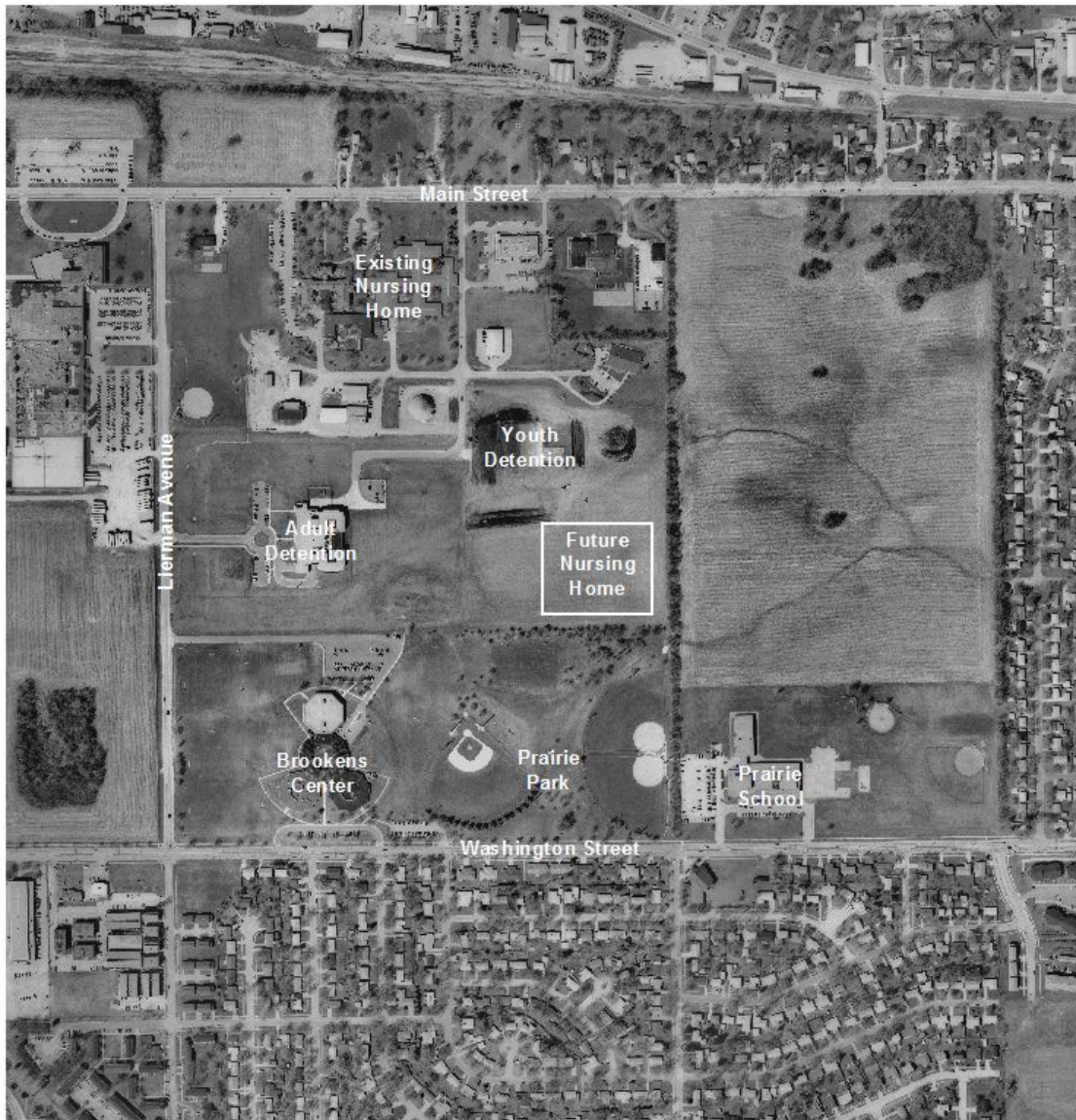
Exhibit "E": Aerial Photo