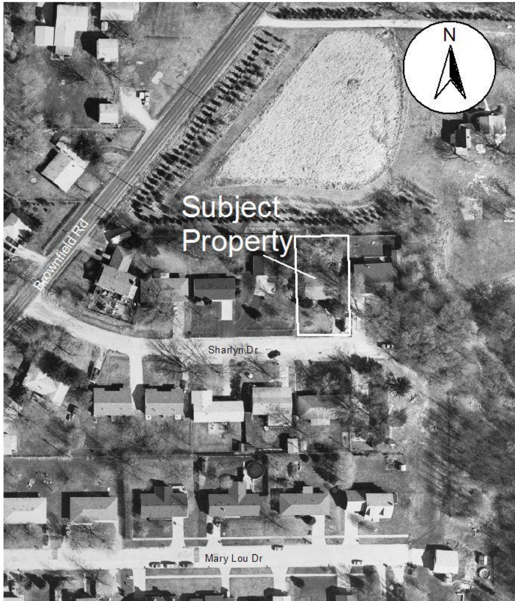
Exhibit "E": Aerial