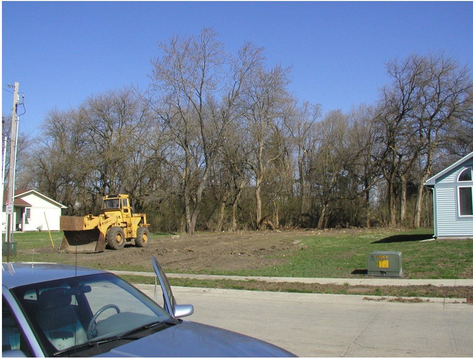
914 W. Eads St.