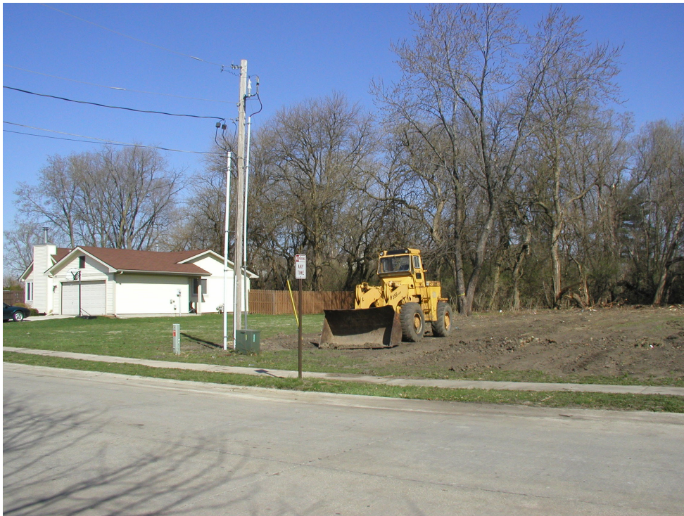
916 W. Eads St.