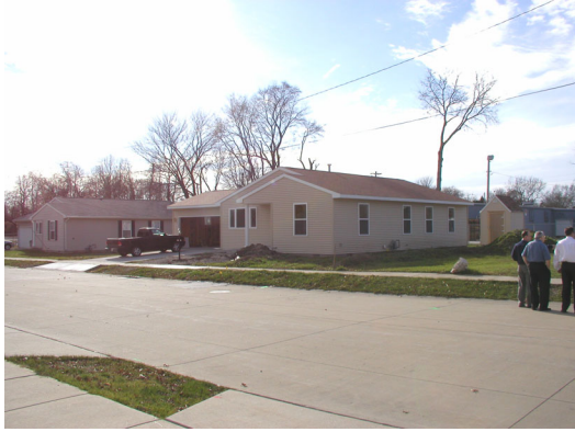
HomeBuild3 Homes 1101-1103 North Harvey Street