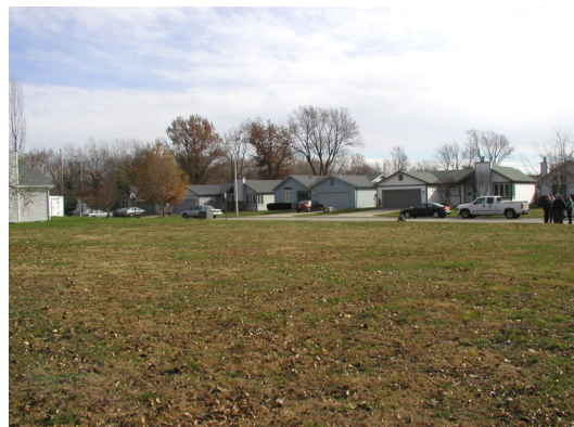
908-910 West Eads Street (looking from the Northwest corner)