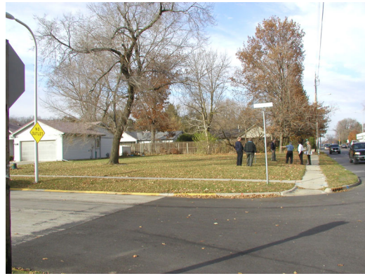
902 Wascher Drive