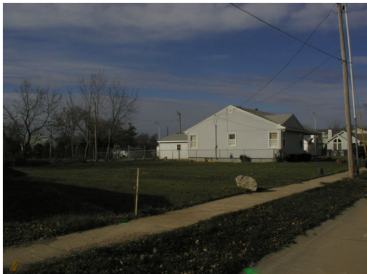
1105 North Harvey Street