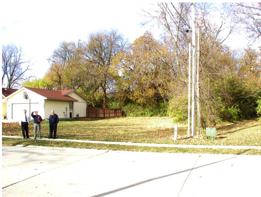
916 West Eads Street