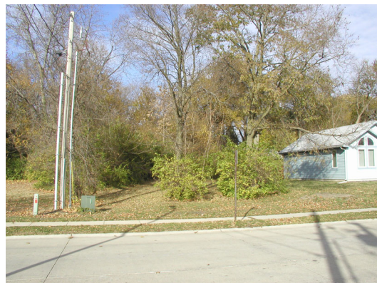
914 West Eads Street: future site of Urbana School District house construction