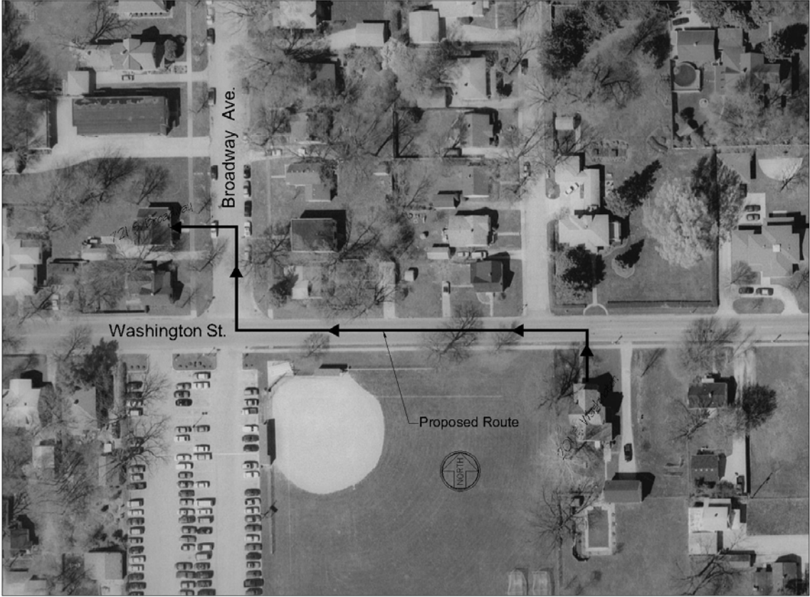
Proposed House Move 201 E. Washington to 721 S. Broadway