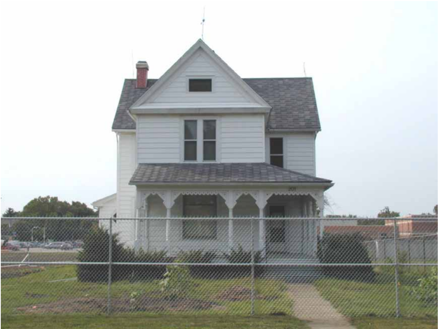
201 East Washington